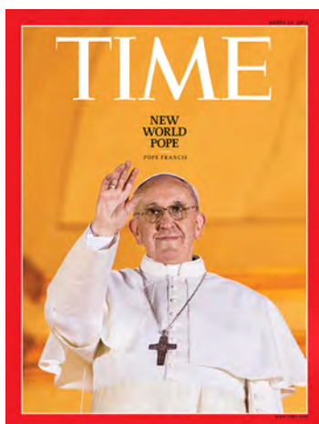
Left: Time magazine of March 25, 2013.

In Crimea it seems that Putin's Russia, an eastern superpower, is winning, while up until now it looked as though the Western superpower (America) was prevailing, given its "democratization" efforts in Africa and the Middle East with the help of large European interests. World governments are motivated by worldly concerns and not anything spiritual that they may be advertising. Their hypocrisy is an advanced evil, characteristic of our times and of our lack of spirituality. The Pope of Rome, ever falling away from the True Faith, is now the leader in hypocrisy.