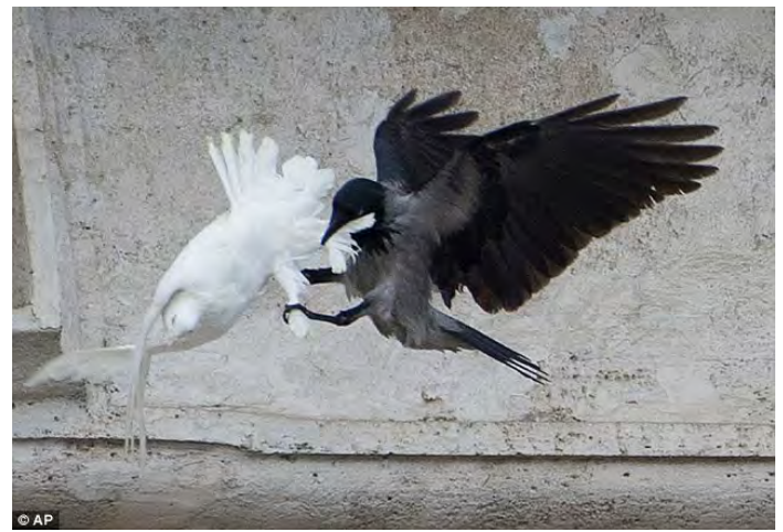
3rd photo: The other released dove is viciously attacked by a carrion crow.

The news of the disturbances in the Ukraine began to verify the bad omens arising from the incident with the doves. The pro-Russian government was overthrown on February 21, 2014 by Western-backed protesters, and a new government was installed. This action was not recognized as legal by the Russians. However, President Putin affirms that Crimea, in particular, is justified in its determination to secede from the Ukraine and to join with Russia. He maintains that Crimea is merely following the same strategy that the West considered legal concerning the secession of Kosovo from Serbia: “Our Western partners created a precedent in Kosovo by their own hand. In a situation exactly the same as that of Crimea, they recognized Kosovo’s secession from Serbia as legal, while agreeing that no permission from the [Serbian] central government was necessary for the unilateral proclamation of independence.”