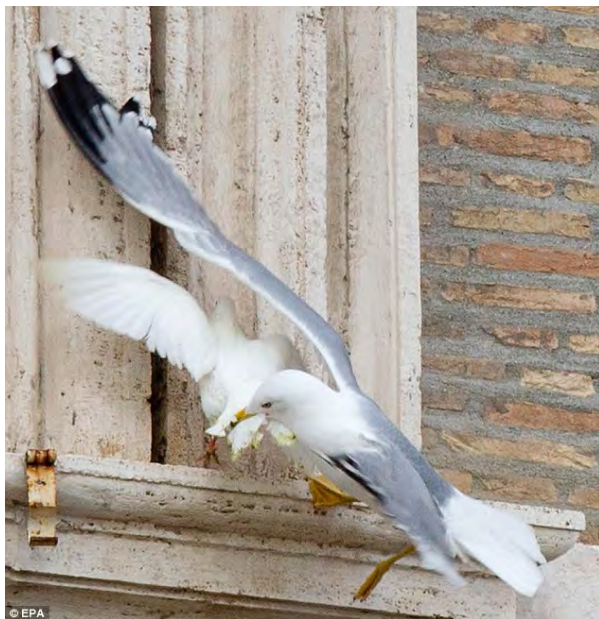
2nd photo: One of the released doves is attacked by a seagull.