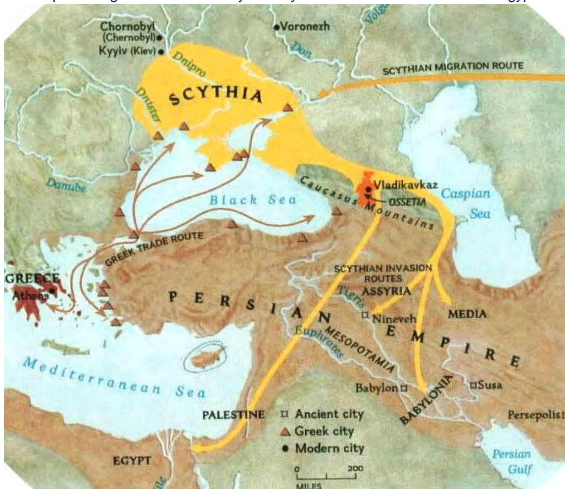
Map showing the routes taken by the Scythians in their descent towards Egypt:

Therefore, now that we find ourselves in a period of apostasy, we are proceeding backwards, from the Ukraine towards Jerusalem and the “Place of the Skull,” in order to learn all that will happen to us, to see that the word of God is true and to be convinced that without repentance all the afflictions prophesied will occur. This is why in Greek the name of Ukraine (Oukrania; ou=no, krania=skulls) characterizes our irrational age, in which rulers and subjects are being governed by three major passions: greed, hedonism and ambition which, when allowed to reach their peak, will cause the mutual destruction of unrepentant people.