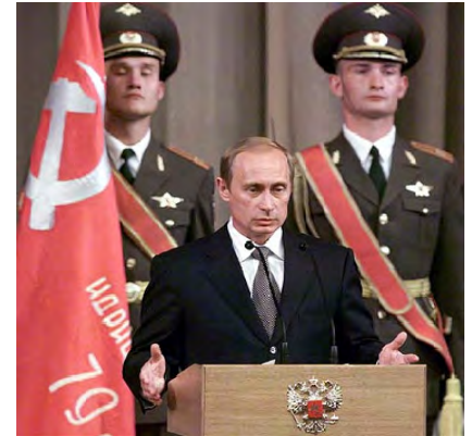
A strange co-existence.

Areas in the Ukraine with a population that supports Russia which rose up against the EU right, after the Western overthrow of the pro-Russian Ukrainian government.